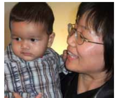
PRVP is a win-win for volunteers and families alike.

a trip to the grocery store with the baby. He had a cart full of groceries when he realized the baby’s diaper really needed changing. Because the men’s washroom had no change table, he went to the ladies bathroom where