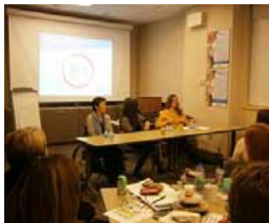
Client and Carer presentations at VHA's quarterly leadership meeting.