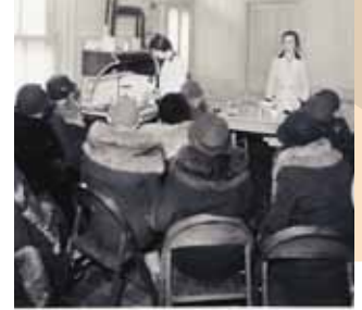
The Visiting Homemakers Association (V.H.A.) also offered housekeeping classes to the community.

What a long way VHA has come since those early days! With over 2,000 staff and service providers throughout Ontario now offering a range of home health and community support services, I'm sure our founder would be as encouraged as we are about what lies ahead for VHA. Here's to the next 90 years – it is indeed a future of possibilities!