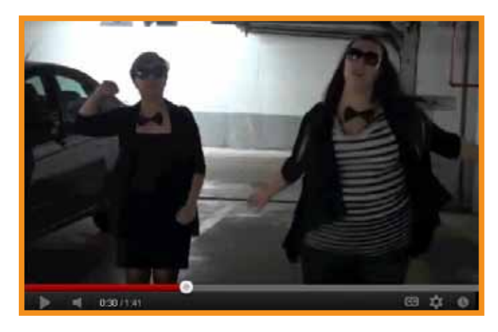
In their winning contest video, VHA Personal Support Coordinators spoofed the popular "Gangnam Style" with their song celebrating VHA's core beliefs. The contest was part of VHA's accreditation preparation.

As always, VHA learned a lot, both in the process of preparing for the accreditation survey and from the survey itself. Our surveyors provided us with thoughtful feedback and suggestions for continuing on our quality improvement path.